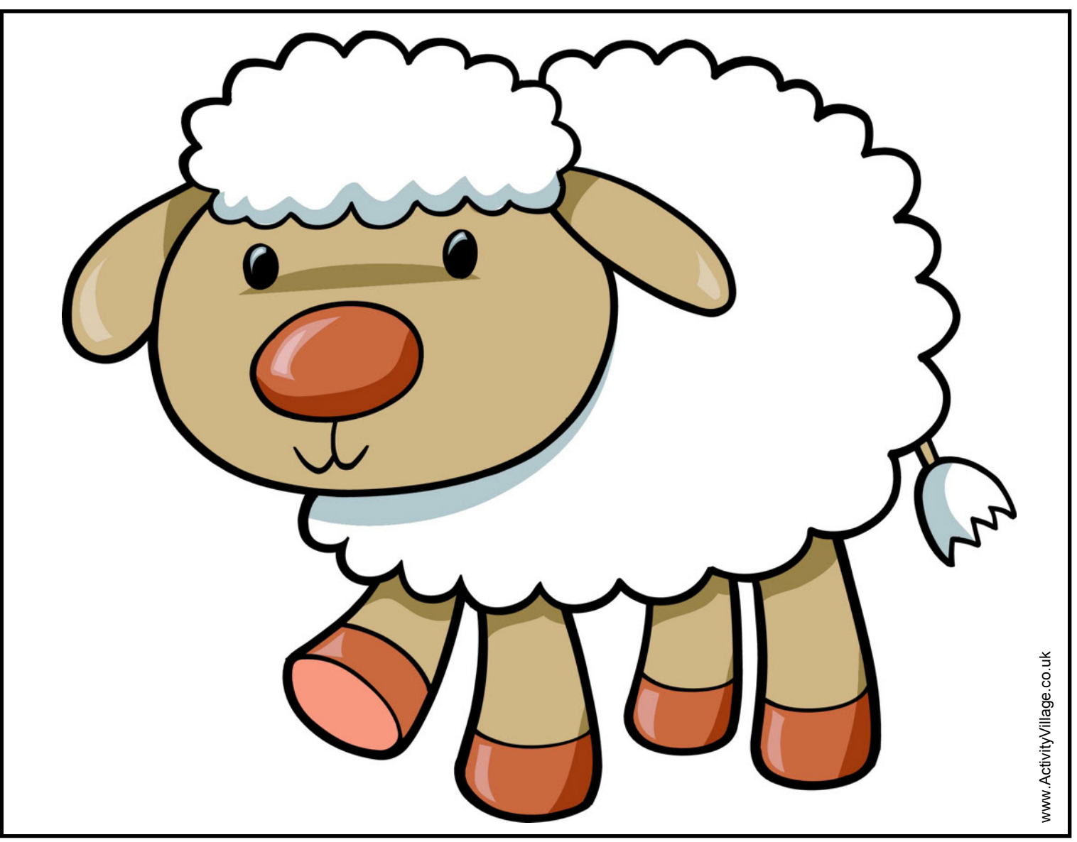
www.ActivityVillage.co.uk - Keeping Kids Busy